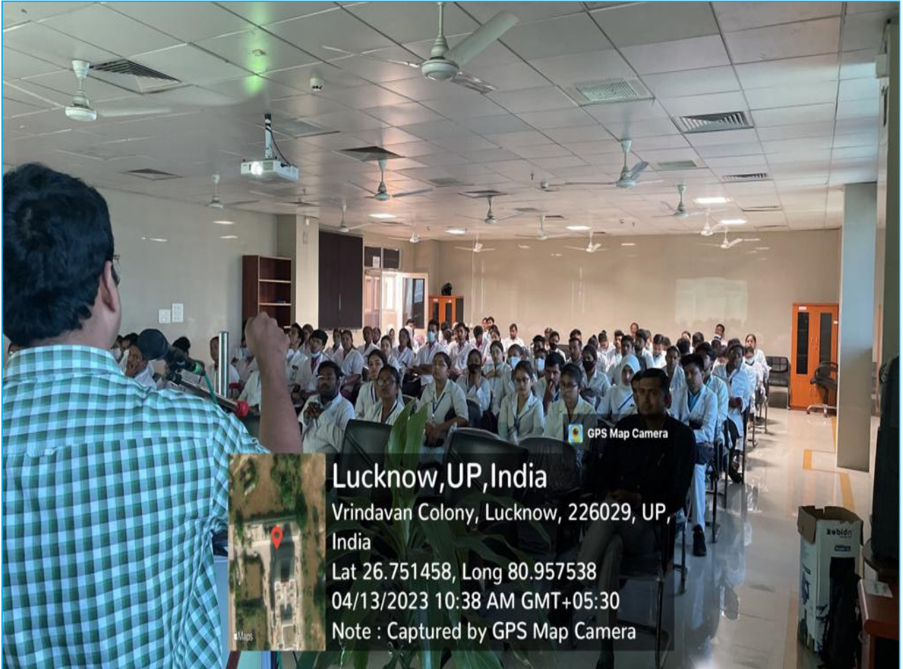
Classroom teaching using projector for nursing students