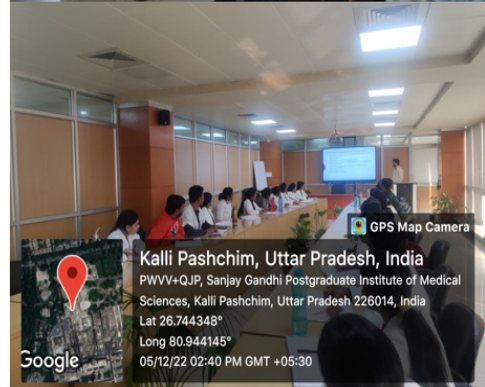
Discussion during Combined grand rounds involving doctors, nurses and paramedical staff