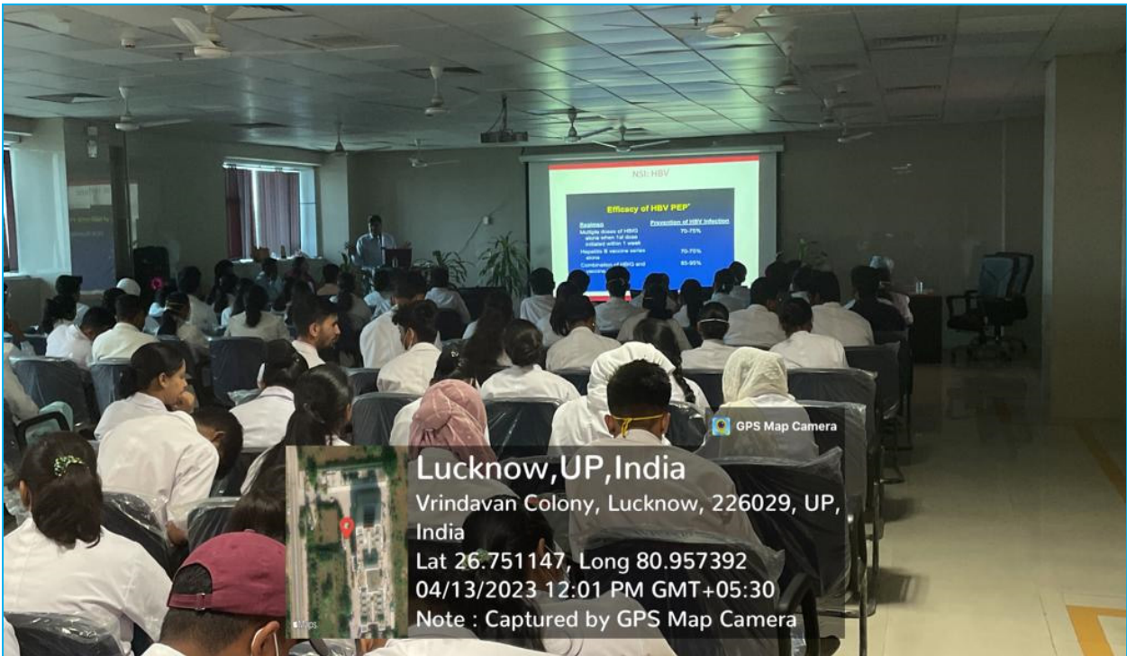
Teaching by faculty using presentations in the classroom